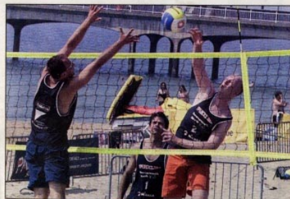
BIG BLOCK: Action from the Boscombe Invitation Cup beach event